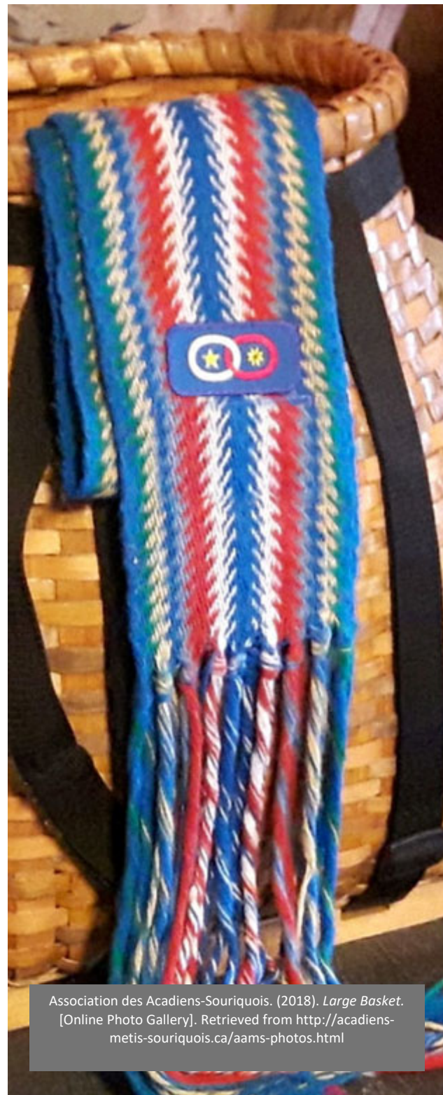
Association des Acadiens-Souriquois. (2018). Large Basket . [Online Photo Gallery]. Retrieved from http://acadiens-metis-souriquois.ca/aams-photos.html

Members If you have any story ideas, messages, or photos you would like included in the AAMS Newsletter or website, please contact the AAMS Office. Members are asked to submit interesting photos for the AAMS social media campaign. The photos must be of typical Acadiens-Métis food, hunting, fishing, trapping, clamming, quilting, organic gardening, activities, and locations... things taught by grandma and grandpa. A one-line photo description or caption must accompany the photo as well as the name of the photographer. Please email your photos to aams.office@gmail.com