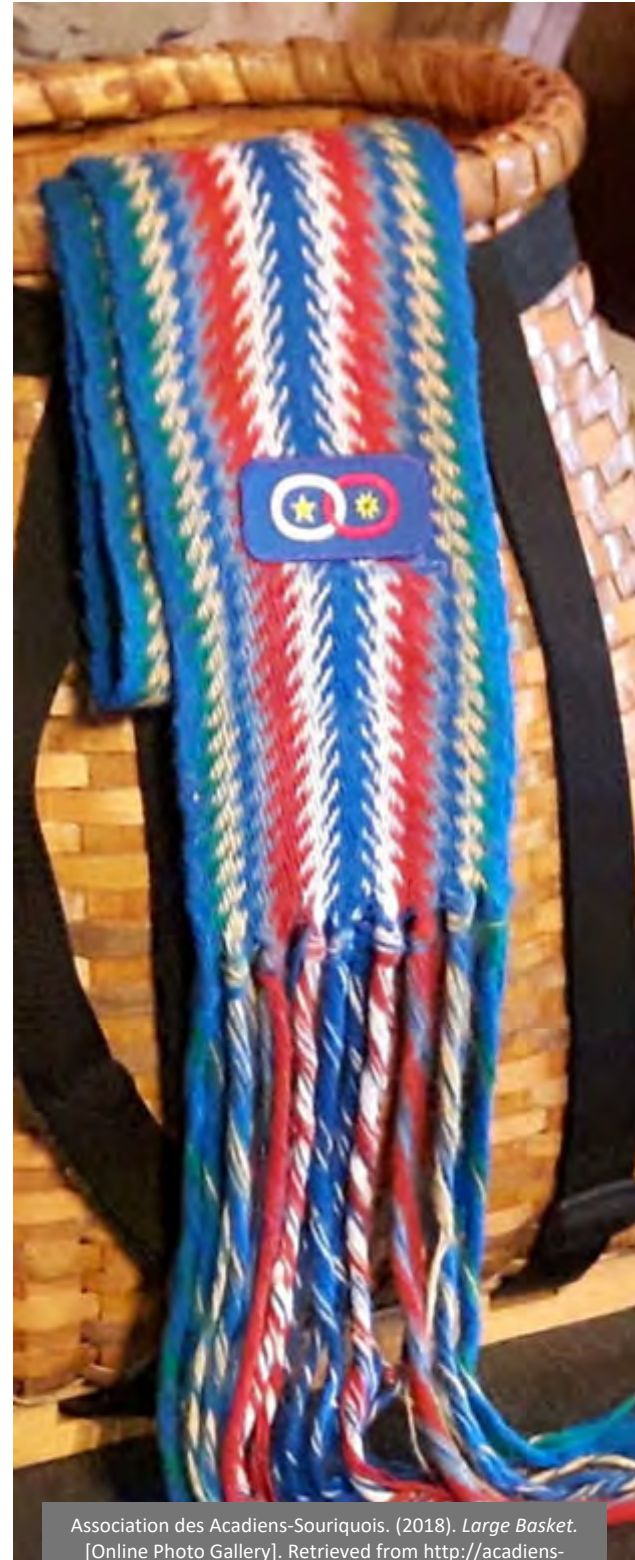
Association des Acadiens-Souriquois. (2018). Large Basket . [Online Photo Gallery]. Retrieved from http://acadiens-metis-souriquois.ca/aams-photos.html

For more info on Mitacs, see: https://www.mitacs.ca/en